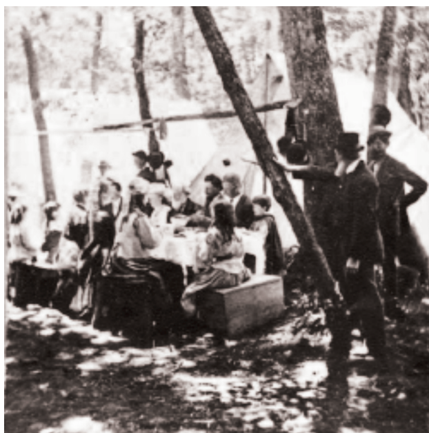
Scenes at a campmeeting at Eagle Lake, Wisconsin