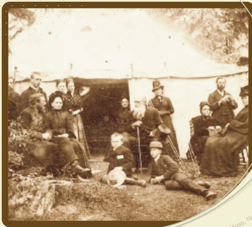
E.G. White sitting 3rd from the right at a camp meeting in Moss, Norway (June 1887)

A COURSE IN CHURCH HISTORY HIGHLIGHTING SIGNIFICANT DETAILS OF INTEREST TO THE YOUTH OF THE SEVENTH-DAY ADVENTIST CHURCH